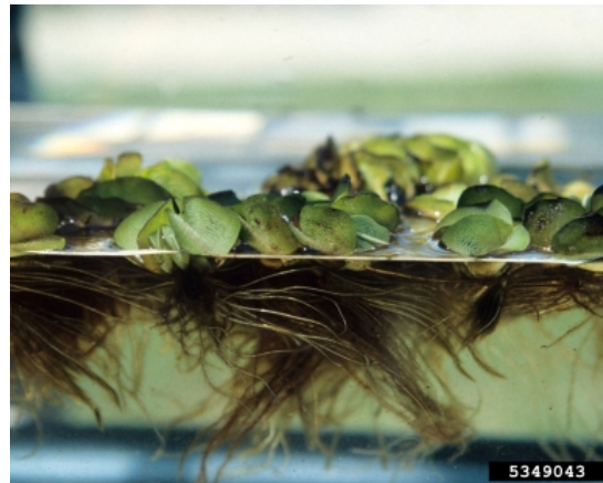
Side view of Giant Salvinia