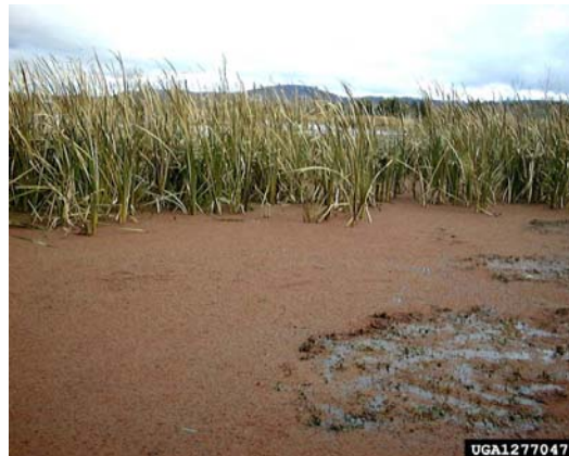
Azolla covering a waterway