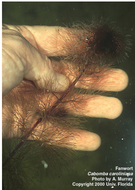
Fanwort Cabomba caroliniana

Illustration provided by: IFAS, Center for Aquatic Plants University of Florida, Gainesville, 1990