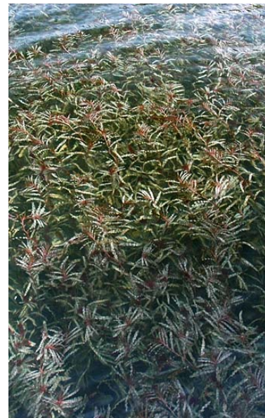
View of P. crispus from boat level