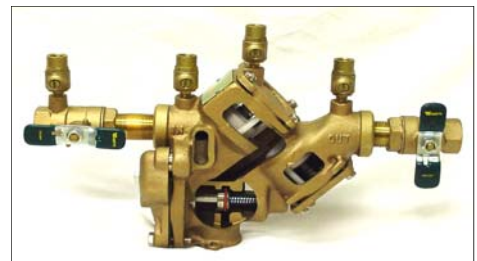
Reduced Pressure Backflow Assembly (RP)

A Reduced Pressure Backflow Assembly (RP) is designed to prevent backflow. The RP consists of two independent spring loaded check valves separated by a spring loaded differential pressure relief valve, two shutoff valves and four test cocks. Idaho's list of approved RP's is included in this brochure.